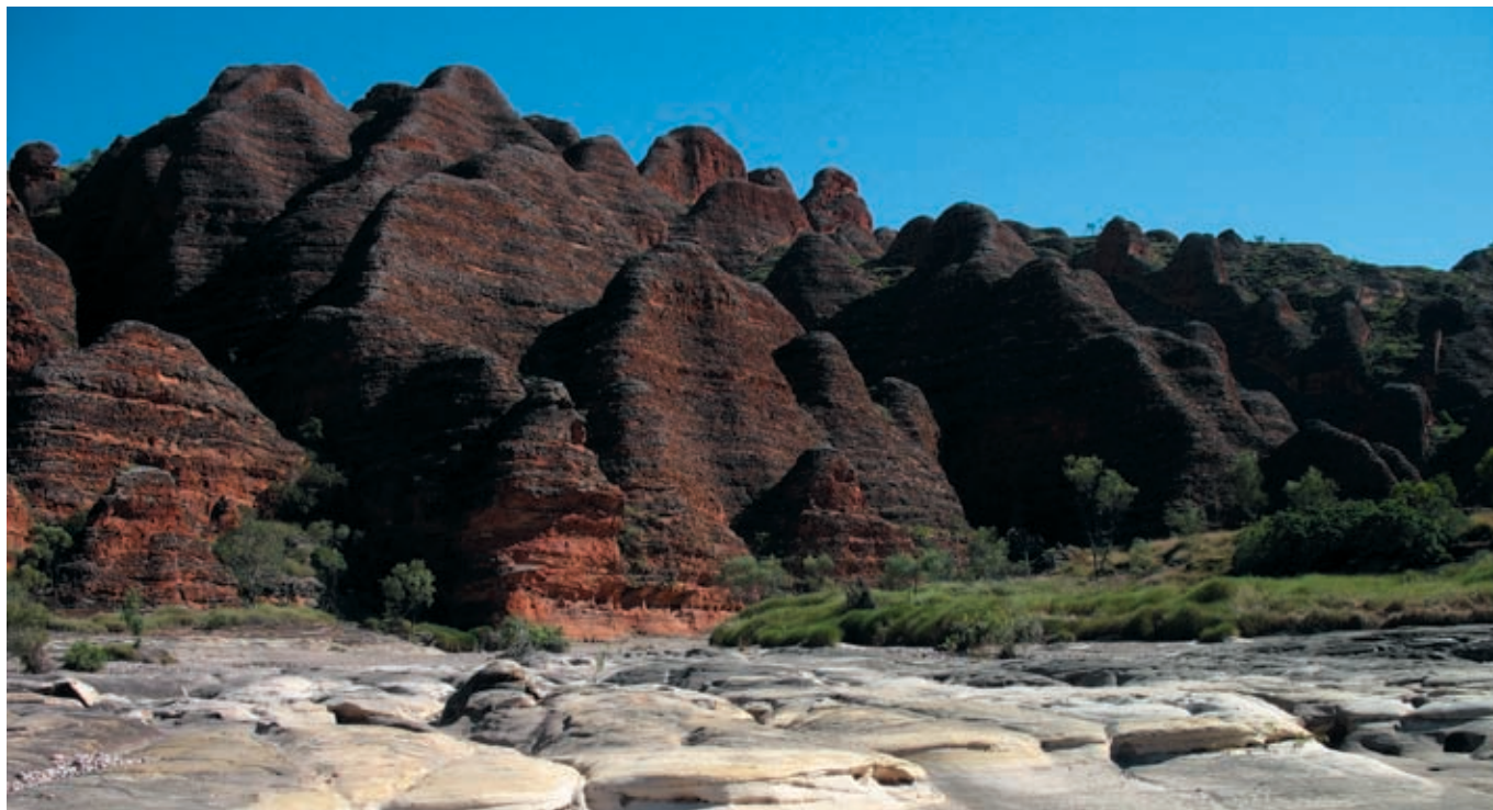
Purnululu National Park World Heritage area, East Kimberley, Western Australia.

The assessment process is rigorous and demanding and not every nominated property is entered on the World Heritage List.