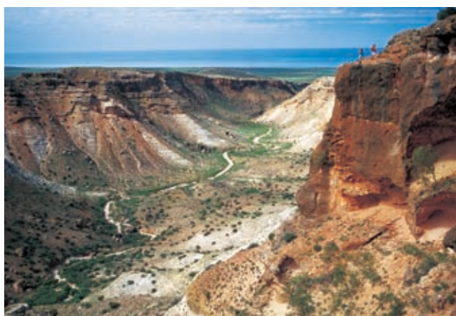
Charles Knife Gorge.

The land and waters of Ningaloo Coast are seen by many to be a globally unique place. The waters contain one of the best reefs in the world, a continuous series of more than 200 kilometres of coral reef off a rugged limestone peninsula. The reef attracts one of the largest gatherings of whale sharks in the world. Cape Range peninsula is built from skeletons of ancient reefs that gradually emerged from under the sea and the underground caves house rare fauna. Ningaloo Coast provides a window into the evolution of reefs, changing sea levels and the movement of continents over time. The unique landscape allows scientists to gain an understanding of biological and geological evolution over the past 150 million years.