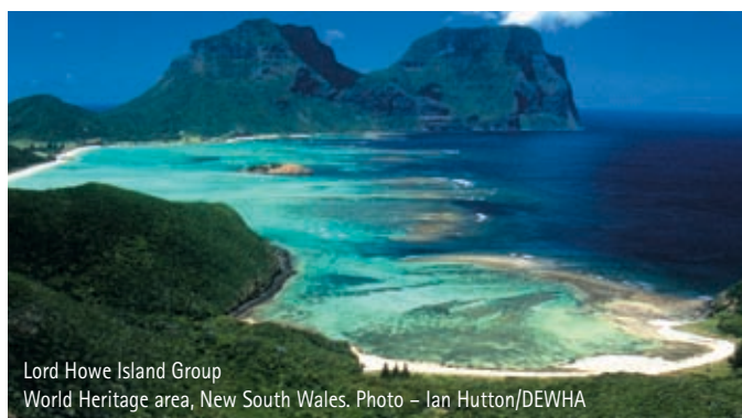
Lord Howe Island Group World Heritage area, New South Wales.