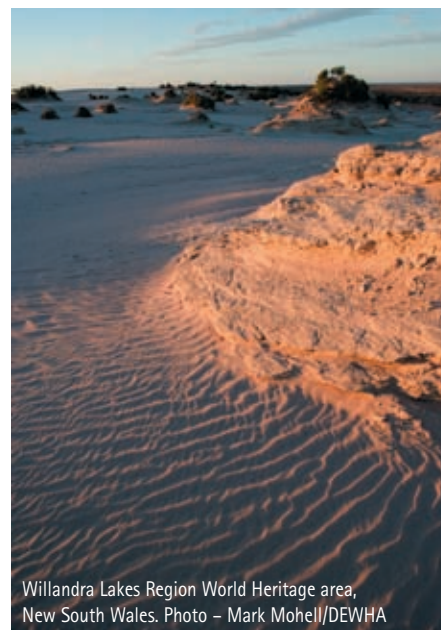
Willandra Lakes Region World Heritage area, New South Wales.