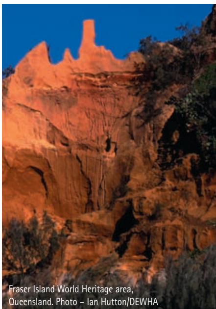
Fraser Island World Heritage area, Queensland.

Phil Thompson, Shark Bay World Heritage Area