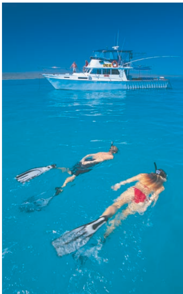
Commercial tour operators show visitors the wonders of Ningaloo Marine Park.

Tourism nodes, including Vlamingh Head and Yardie Creek Homestead, will be able to accommodate development and commercial activities to provide a range of visitor services and amenities, whilst ensuring that the values of the area are maintained.