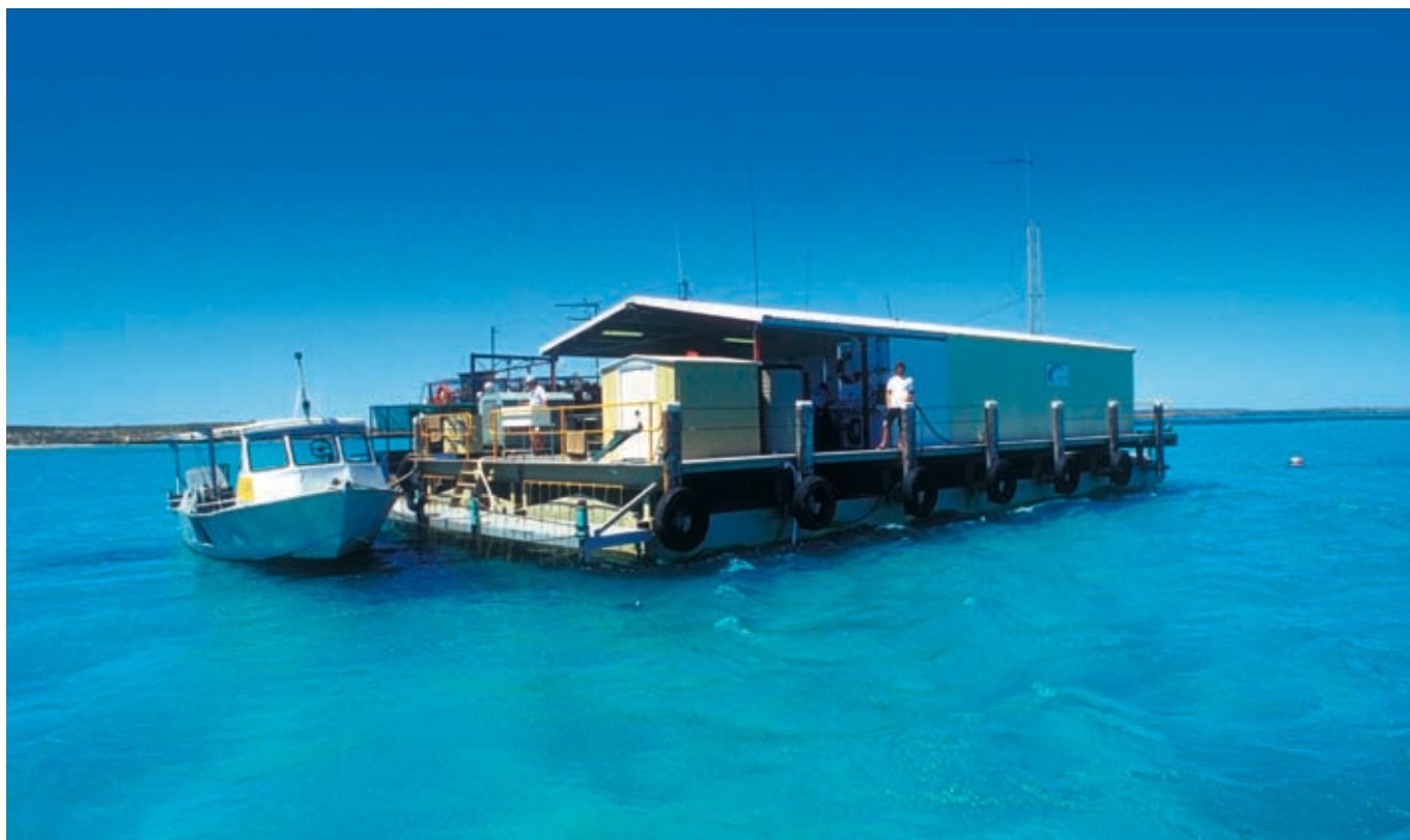
Pearling aquaculture in Shark Bay World Heritage area.