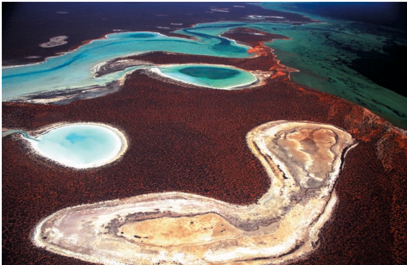
Shark Bay World Heritage area, Western Australia.