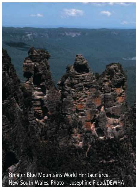
Greater Blue Mountains World Heritage area, New South Wales.

Alan Dyball, Environmental Protection Agency, QLD.